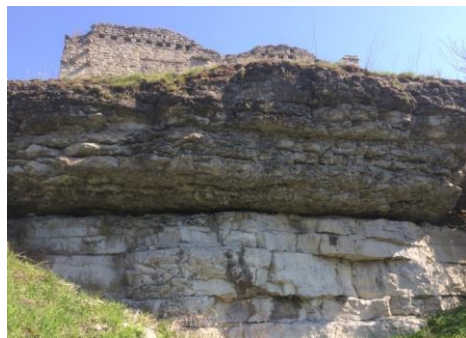
Photo 1. The outcrop of the upper part of the scal series of the upper silur on the slope of a cape protrusion in Skala-Podilska

Obviously, the foundations of the fortress were laid in these limestones. Although, as a building material, they were hardly ever used because of relatively weak connectivity, uneven density, fragility, and so on. The castle walls are composed of strong, massive, weakly cracked, pale gray, gray and dark limestones of the lower pack, which, apparently, was sufficient in the surroundings. Only in the walls of the Tarlo Palace can be observed some limestones of the younger – Neogene age, which are now mined on the Khmelnitsky side of the Zbruch.