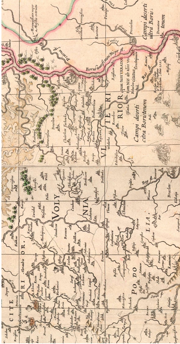
Figure 55. Fragment of Radvyla map with the depiction of Volhynia and the area on the right bank of Dnieper referred to as "Vkraina." Joan Bleau, Le Theatre De Mondou Novel Atlas (Amsterdam, 1649).