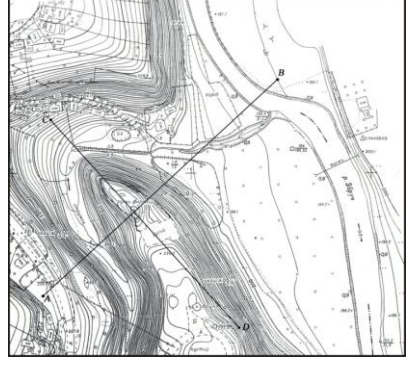
Fig. 1. The plan of the territory of the castle and the outskirts in Skala-Podilska (Zoom 1:2000)

The width of the pebble protrusion along the cut line AB is 90 m, the length is from the road to the ruins of the proto castle tower (the extreme north-eastern hor