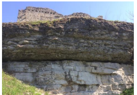
Photo 1. The outcrop of the upper part of the scal series of the upper silur on the slope of a cape protrusion in Skala-Podilska

Obviously, the foundations of the fortress were laid in these limestones. Although, as a building material, they were hardly ever used because of relatively weak