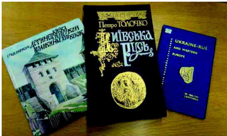
Books about Kyivan Rus' and Kyiv from the British Library's collections.

The church has been the object of research for almost 400 years and can still be seen today in graphic reconstructions and in the findings of archaeological excavations, continued today by the Institute of Archaeology at the National Academy of Science of Ukraine.