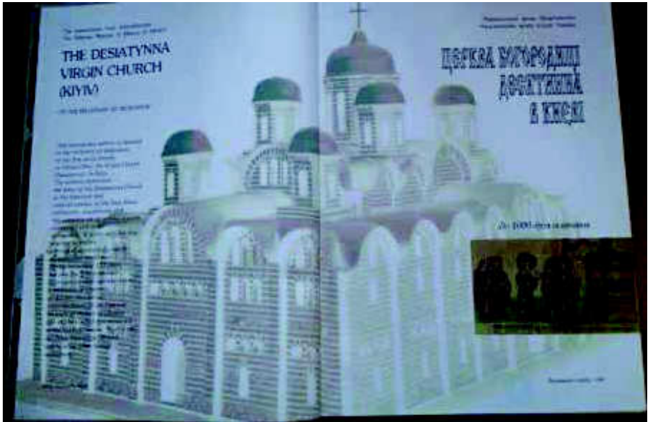
Title page of Tserkva Bohorodytsi Desiatynna v Kyievi, (Kyiv, 1996). LB.31.c.9576, with an image from the 15th-century Radziwill Chronicle showing the Consecration of the Church of the Tithes

The building of the church was the culmination of Volodymyr's Christianisation of Rus', which helped establish close relations with Byzantium, and brought his people to acknowledge Graeco-Roman culture. The church took seven years to build and was consecrated on 12 May 996. Much of the building work was carried out by craftsmen from Byzantium. Although its official name was to be the Church of the Dormition, it soon became popularly known as the Church of the Tithes (Desyatynna Church), because to celebrate its opening, Prince Volodymyr held a great celebration and set aside one tenth of his revenues for the maintenance of the church.