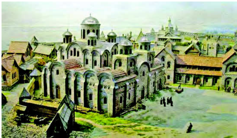
Central part of the ‘City of Volodymyr’, with the Church of the Dormition. Reconstruction from the Museum of the Institute of Archaeology of the National Academy of Science of Ukraine.

The church contained the relics of saints – Pope Clement I and his disciple Phoebus – which Volodymyr had also brought from Chersonesus. Here, too, he brought the sarcophagus of his grandmother, Princess Olha. In front of the church there was a square, where Volodymyr placed four ‘copper shrines’ (possibly ancient altars) and copper figures of horses which had formerly adorned Chersonesus. Situated in the very heart of Volodymyr’s seat of power, the Church dominated not only the Upper City of Kyiv, but also the lower area, known as the Podil, and enhanced the ancient capital by its remarkable beauty.