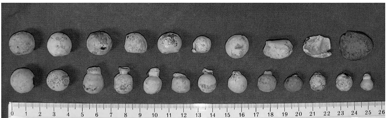
Fig. 3. Examples of 17 th century ammunition

Building on the success of the Little Bighorn project, scholars followed the methodology outlined by Scott and began using metal detectors to survey other battlefields. By plotting the distribution of artifacts along a several square mile X and Y grid, it became possible to identify patterns across great distances.