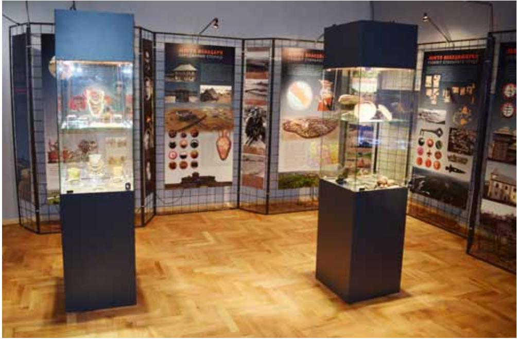
Fig. 4. Fragment of the exhibition “The capital city of Zvenyhorod – return from nonexistence”

from the princely era, in particular: the wooden church and the tanks on the detinets, from the second half of the 11 th c., the stone church of the princely palace and the tomb on the okolny gorod ; adjusting the Bilka river bed (as an element of the city’s fortification system) to restore its shores to their natural appearance; and the revitalisation of the landscape of the river valley.