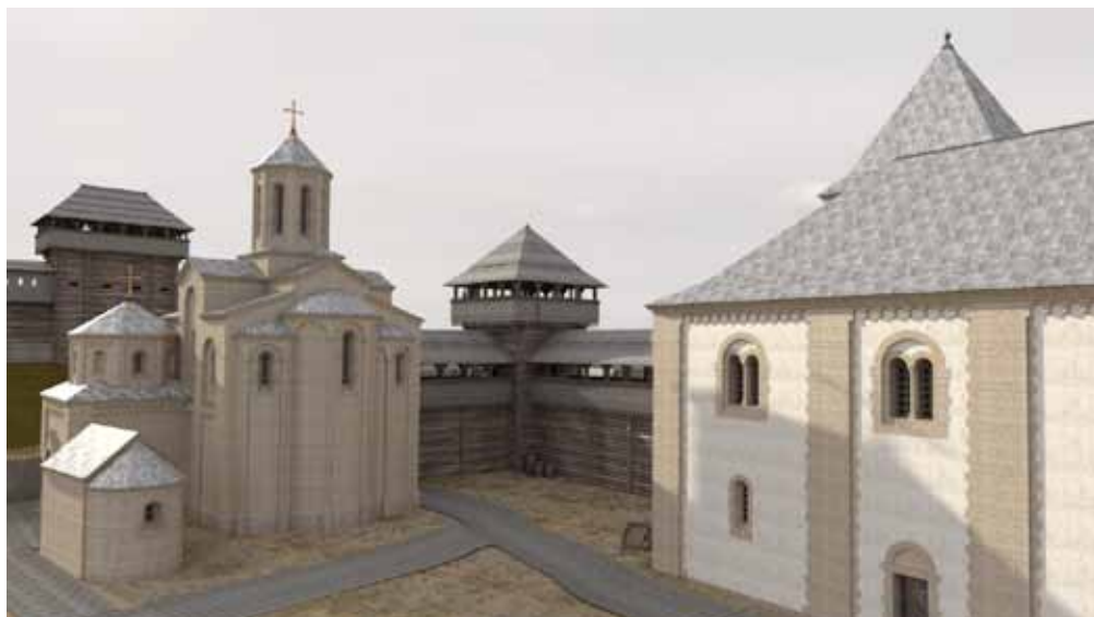
Fig. 5. White-stone princely palace and church, connected by a gallery passage (Reconstruction by A. Kharkhalis)