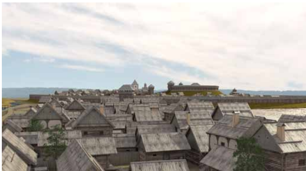
Fig. 6. North-eastern prigorod (Reconstruction by A. Kharkhalis)