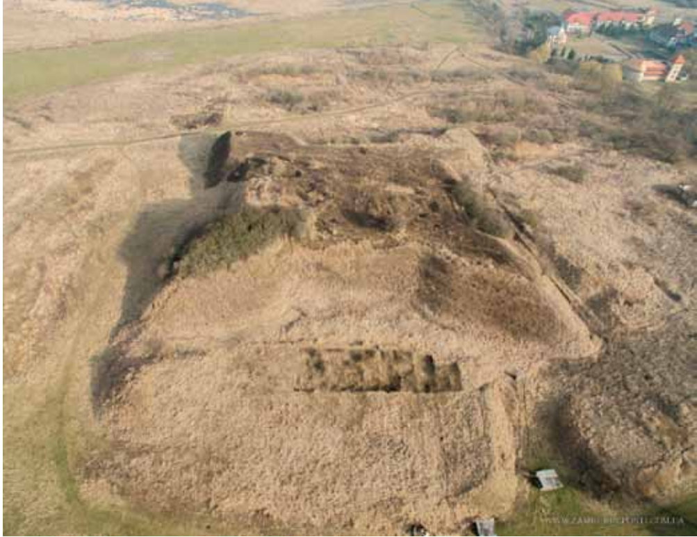
Fig. 3. General view of the hillfort with bastions of the upper castle in the centre

the town with escarpment curtain walls (Fig. 3) and on okolny gorod – a system of earthen bastions). The microtoponyms “Horodyshche” and “Valy” 3 have survived from the ancient hillfort.