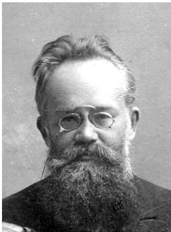
Fig. 5. Mychajlo Hrushevsky. 1907. From the collection of the Mychajlo Hrushevsky State Memorial Museum in Lvov.