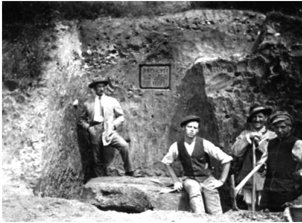
Fig. 11. Excavation at Holyn near Kalush.