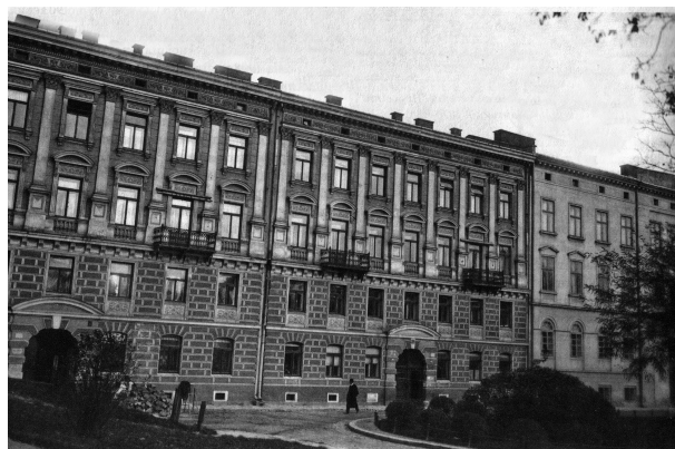
Fig. 6. The Shevchenko Scientific Society.