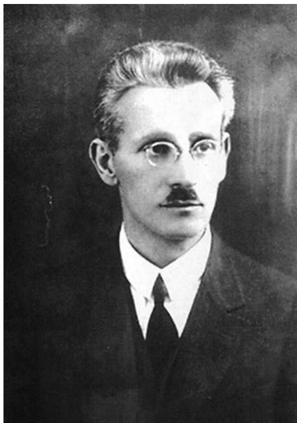
Fig. 9. Ivan Krypiakevych (1886–1967).