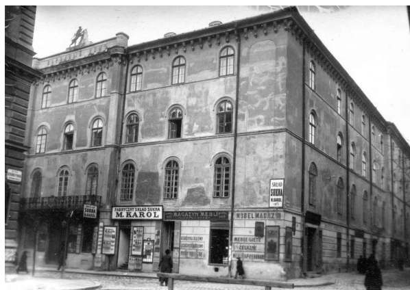
Fig. 4. Community Hall of the Academic Gymnasium.