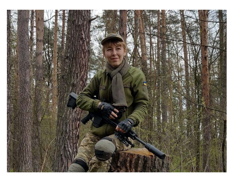
\mathbf O Fig. 1.3.5 An example of a "combat women'smilitary" — a female sniper after pre-firing a rifle

Although O. Bilozerska made posts on the Facebook page and duplicated them on the website throughout the year of the russian-Ukrainian war, 9 full-length photos were available for consideration during this period in the frame of "female military", only 5 (55,55 %) of which can be defined according to the above criteria as "combat military" ( Fig. 1.3.5 ).