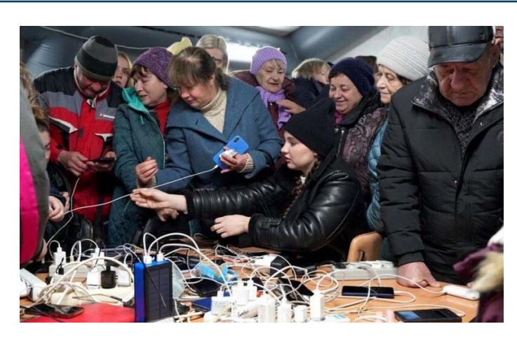
Q Fig. 1.3.2. Ukrainians charge mobile devices at special points during a blackout Note: illustrative photo from open sources

The war, which is waged simultaneously with the means typical of the period of the Second World War and the latest weapons that are increasingly used, combines combat operations with the destruction of civilian infrastructure, financial and economic instruments and large-scale informational and psychological operations. In the media sphere, from the Ukrainian side, state control and propaganda on radio and television, Internet resources is combined with the free existence of the world's leading social media platforms ( Fig. 1.3.2 ).