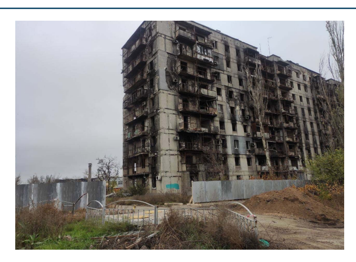
○ Fig. 1.3.6 Sample of the "war ruins" frame