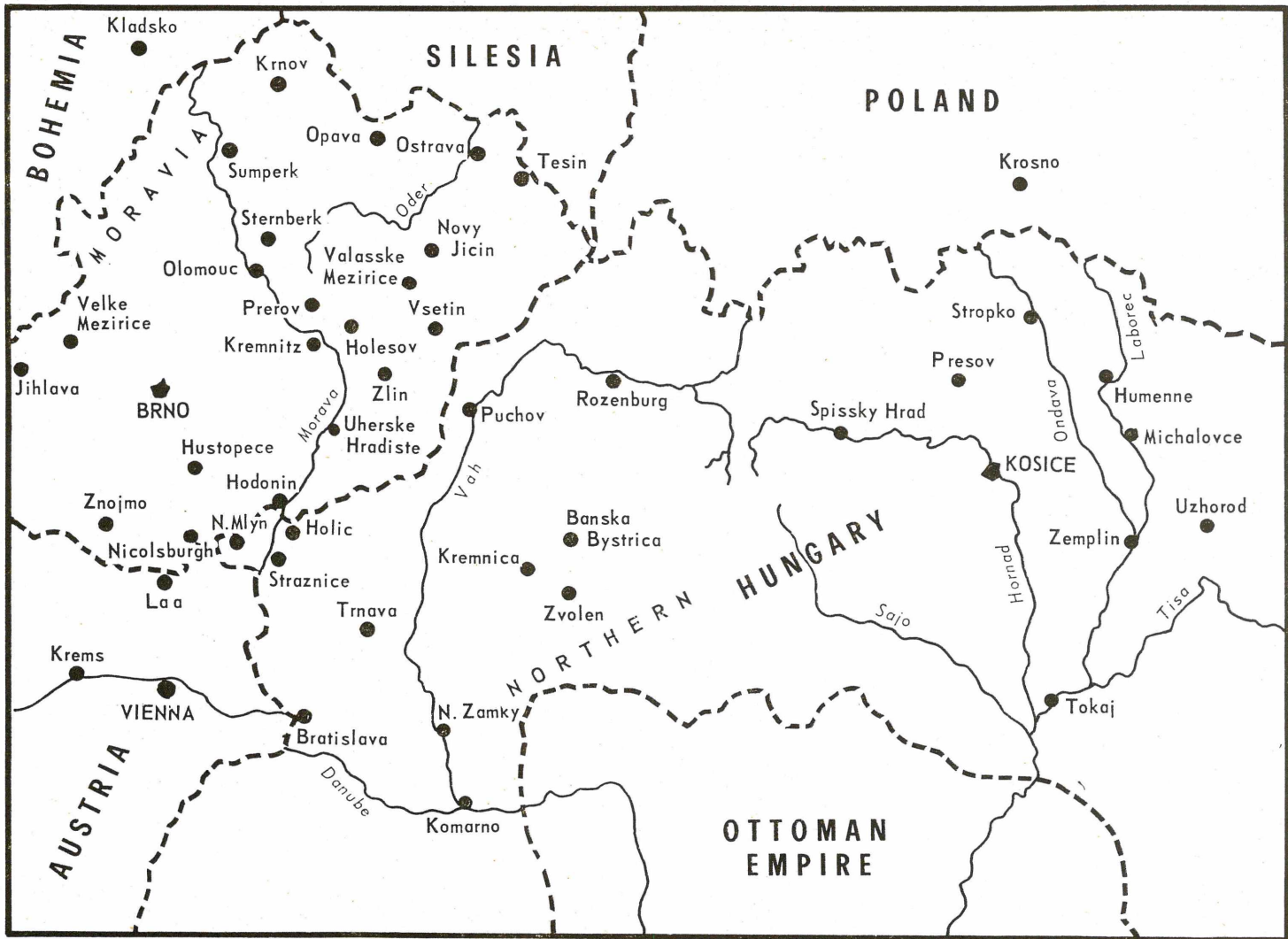
MAP II: MORAVIA AND NORTHERN HUNGARY