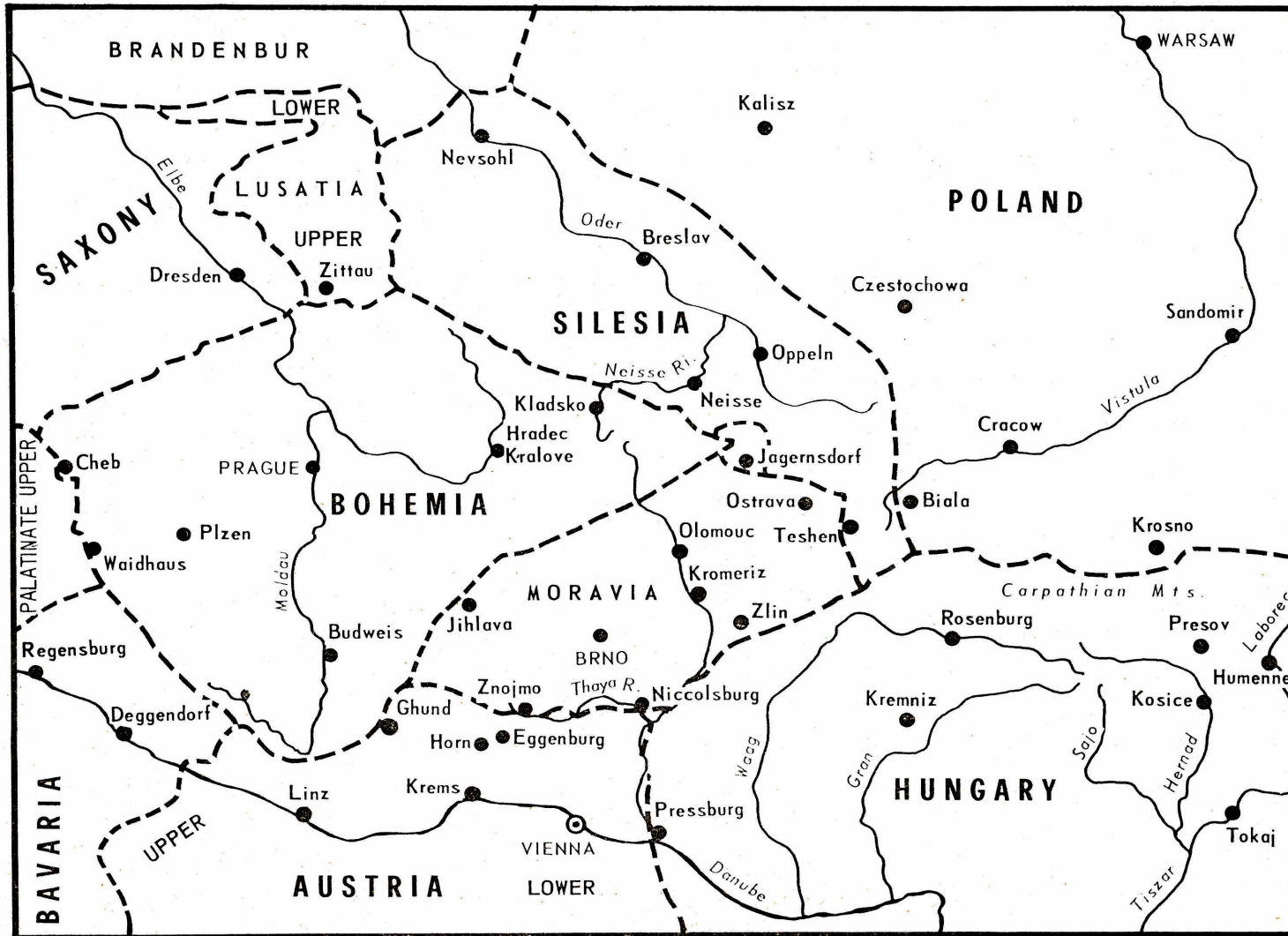
Map. III: BOHEMIAN PROVINCES AND NORTHERN HUNGARY